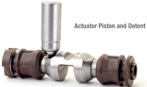
Actuator Piston and Detent